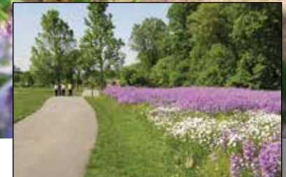
MONTGOMERY COUNTY, PENNSYLVANIA