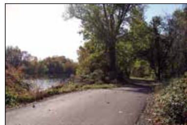
MONTGOMERY COUNTY, PENNSYLVANIA